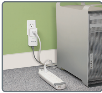
Room 1: Home Office Install the first Powerline AV+ 200 Adapter (XAV2501) 3