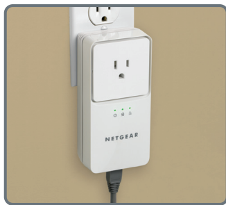
Room 2: Living Room Install the second Powerline AV+ 200 Adapter (XAV2501)